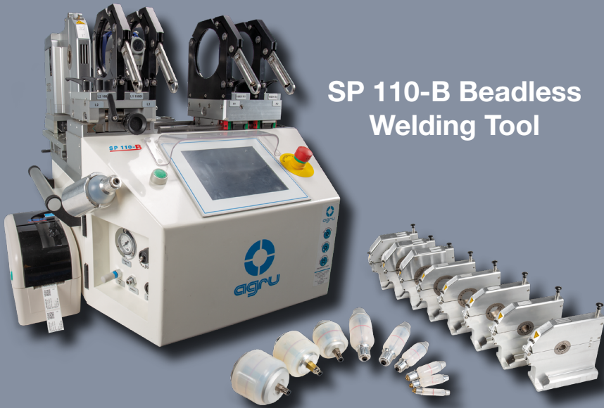
SP 110-B Beadless Welding Tool