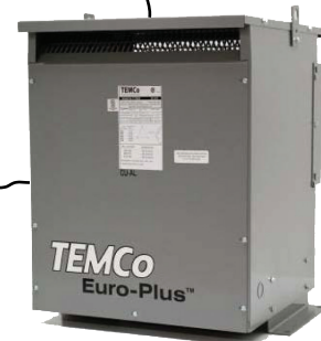
Transformer 208 3ph to 400 3ph