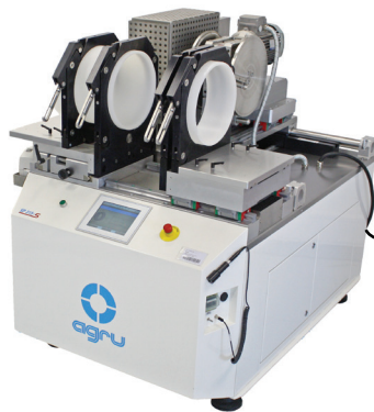
Tool SP-250-S or SP 315-S